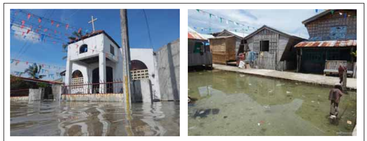
Tidal flooding and adaptation. Roads (right) and floors of important community services such as chapels (left) have been elevated in the islands of Tubigon.

An inundation survey conducted by the authors in 2016 reveals that median flood heights in Batasan and Ubay islands measure up to about 40 cm, while in Pangapasan and Bilangbilangan they are about 20 cm (Jamero et al. 2017). Three out of four islands were completely inundated, with only the school grounds (which also serve as an evacuation area) of Bilangbilangan being spared from the floods. Analyzing the observed flood threshold per island against the 2016 tidal calendar, the authors found that flooding could occur in Batasan and Ubay for up to 135 days, and in Pangapasan and Bilangbilangan for up to 44 days. Flooding on these days, which often occurs around the new and full moon phases of each month, may be partial or complete, depending on the actual tide level and local weather conditions.