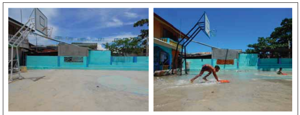
Bilangbilangan school grounds. During peak tides of +2.0 meters in June 2016 (left) and in June 2018 (right).

However, succeeding inundation surveys (conducted annually, around the king tide, since 2016) reveal that the situation of tidal flooding in the island communities in Tubigon may be getting worse. For example, the school grounds of Bilangbilangan island, which was spared from the floods in 2016, has already become inundated as well in 2018 (see picture on the right below). Interview with residents also indicate that the height of tidal flooding has been increasing each year across all islands.