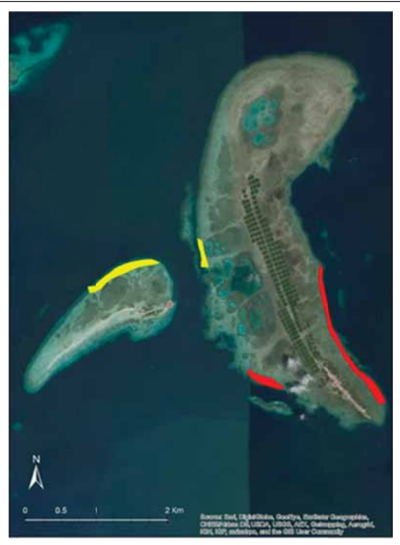
Mined areas of Ubay (yellow) and Batasan (red). Mapped by mounting a Global Positioning System (GPS) device with tracking function onto a motorized boat. The operator, a key informant (the chairperson of the Marine Protected Area Management Council of Batasan, who was born and raised in Ubay), then drove along the perimeter of the mined areas (map generated by Ma. Laurice Jamero using ArcGIS).

In the existing literature, cost analysis has often been used as a means to understand a community's ability to adapt by comparing its financial resources with costs entailed by implementing various adaptation strategies (Nicholls and Tol 2006). In most cases, these studies find that small island developing states may be unable to afford engineering methods that tend to be very expensive (Yamamoto and Esteban 2014), hence rendering them vulnerable to climate change. However, as a glaring counterexample, the island communities of Tubigon have so far been able to adapt to tidal flooding despite their poverty and their use of basic technology (e.g., using local tidal information to determine the need for evacuation) or even traditional knowledge (e.g., building stilted houses, taller furniture). Thus, financial cost may not be enough to define the limits of adaptation, although the analysis of nonmonetary costs, such as social and cultural, may prove more meaningful.