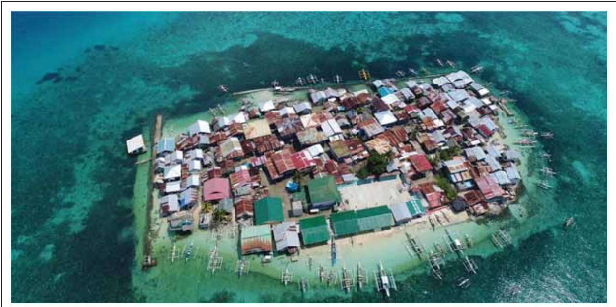
Aerial view of Bilangbilangan island. Bilangbilangan becomes partially or completely inundated during normal spring tides, depending on local weather conditions.