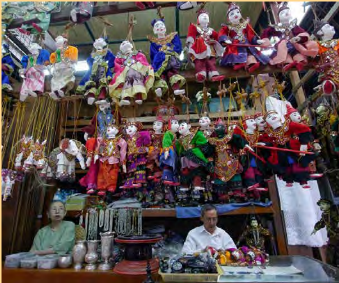
Seizing opportunities to increase productivity. Stalls at Bogyoke Aung San Market, a tourist destination situated in the heart of Yangon, Myanmar.

When completed by 2020, the project ideally will have demonstrated how to help local residents take advantage of the socioeconomic benefits resulting from road improvements. It is a model that can be easily scaled up in Mon State and replicated in other parts of the country. It promotes entrepreneurship among migrant returnees and families of migrants through the productive investment of remittances. And by promoting infrastructure improvements, it connects lower-income groups with markets and enables lower-educated residents to access training and salaried employment.