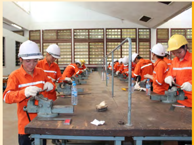
Power tools. Women students from the Lao-German Technical College in Vientiane are learning technical skills in trades and using power tools and equipment.

While there is a high participation rate of women in the country’s labor force, they are largely in low-end, low-paid jobs. Such a seemingly gravitational route for women is as much a reflection of what girls learn (or do not learn) in school or in training and what their role models engage in as it is a reflection of cultural influences.