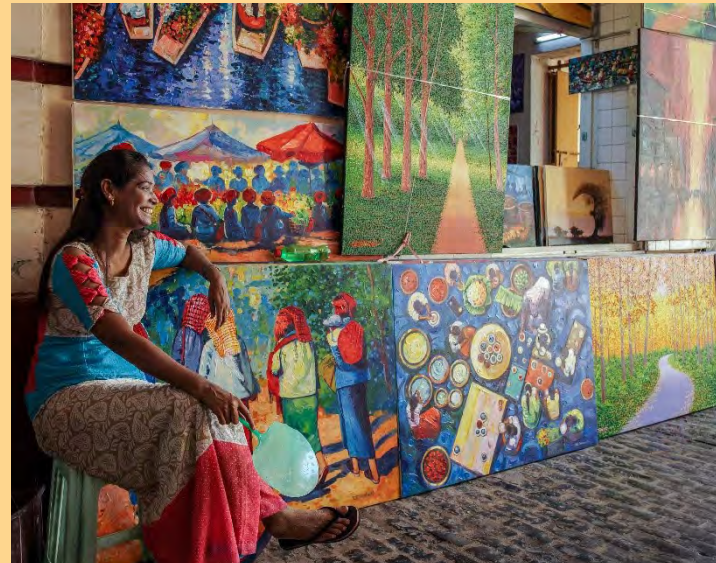
Reaping benefits of increased integration and tourism. Souvenir and handcraft stall owners keep shop at the Bogyoke Aung San Market.