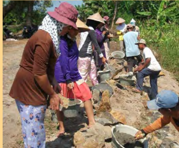
Women in construction work. Women helping to building a village access road in Indonesia.

The gender action plan also specified that 30% of all jobs created through the project were to be provided to women. These included