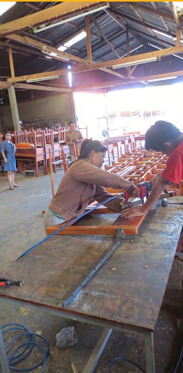
Women building furniture. Young student in Luang Prabang Vocational College receives hands-on training on woodworking in a furniture shop.