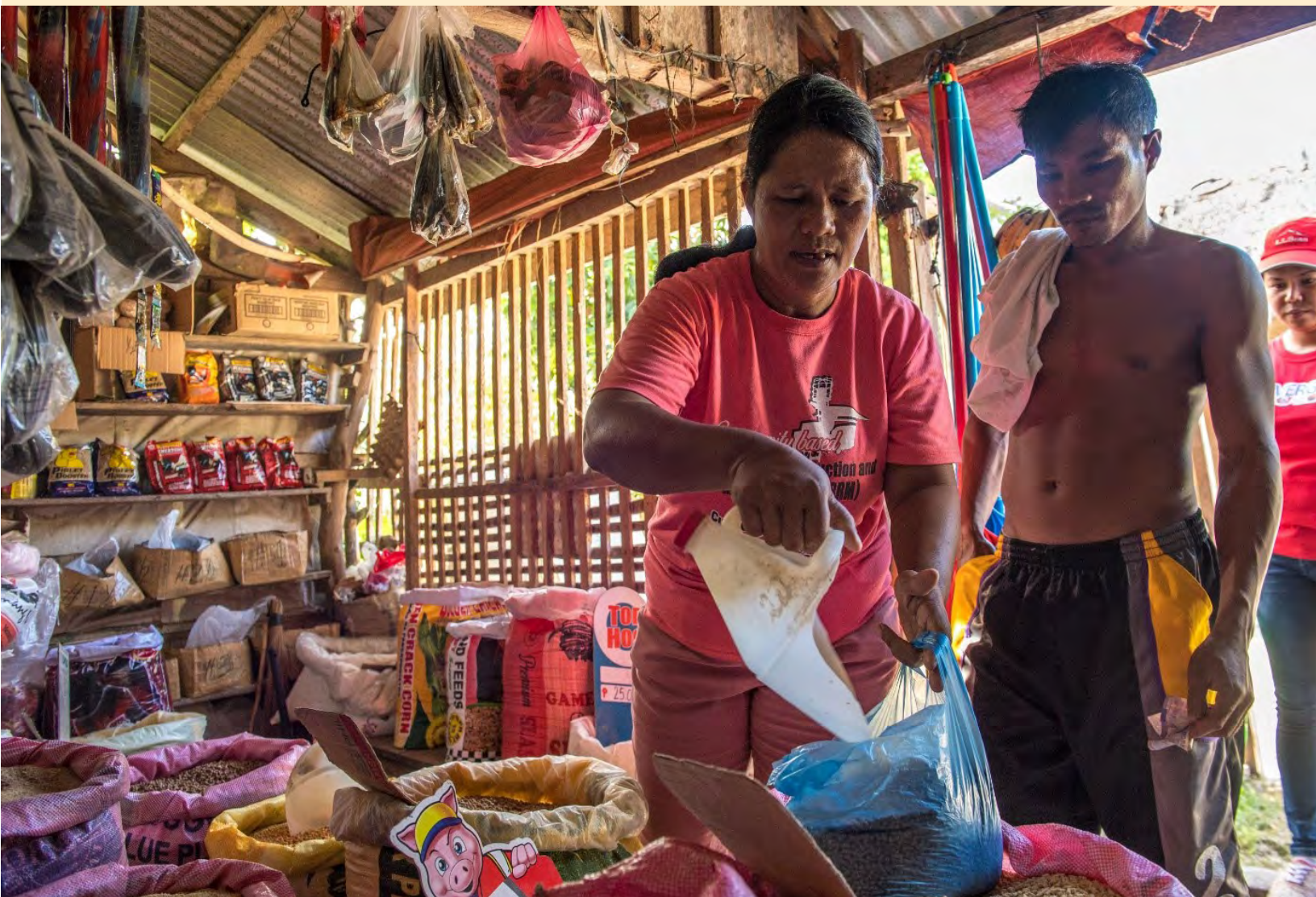
Economic empowerment through microenterprise. Women supported by the Pantawid Pamilyang Pilipino Program received skills trainings on livelihood and support for microenterprise development from the government's Sustainable Livelihood Project.