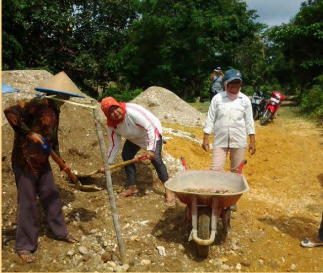
Women in road construction. Women workers leading the road construction at Kabupaten Tanjung Jaung Timur in Jambi province.