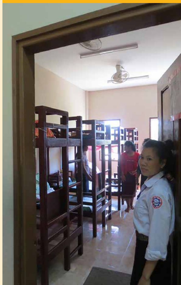
Dormitories improving girls' access to TVET. By building student dormitories for women in Luang Prabang Vocational College, ADB addresses gender constraints in accessing TVET for young students from remote villages.

Although the project could not, on its own, reverse the cultural, social, and economic factors that preclude girls and women from the traditional male skill areas, it was characterized upon its completion as a good first step, with infrastructure, networks, and role models in place.