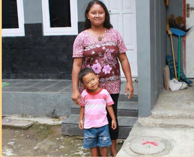
Why gender matters in water and waste. A proud mother in central Java stands in front of her house now connected to the communal sewage treatment plant. The covered hole with a red mark is part of the plant's system to check wastewater disposal to ensure no polluting of groundwater.