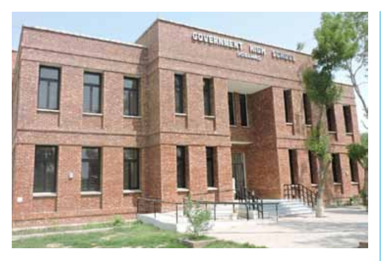
Government High School Dodanko, District Sukkur, Sindh. Built as part of the United States Agency for International Development's Sindh Basic Education Program (SBEP) and operated under the Government of Sindh's Education Management Organizations program (photo by SBEP).

Source: Government of Sindh, School Education and Literacy Department. 2017. Public Private Partnership (PPP) Guide and Toolkit. Karachi.