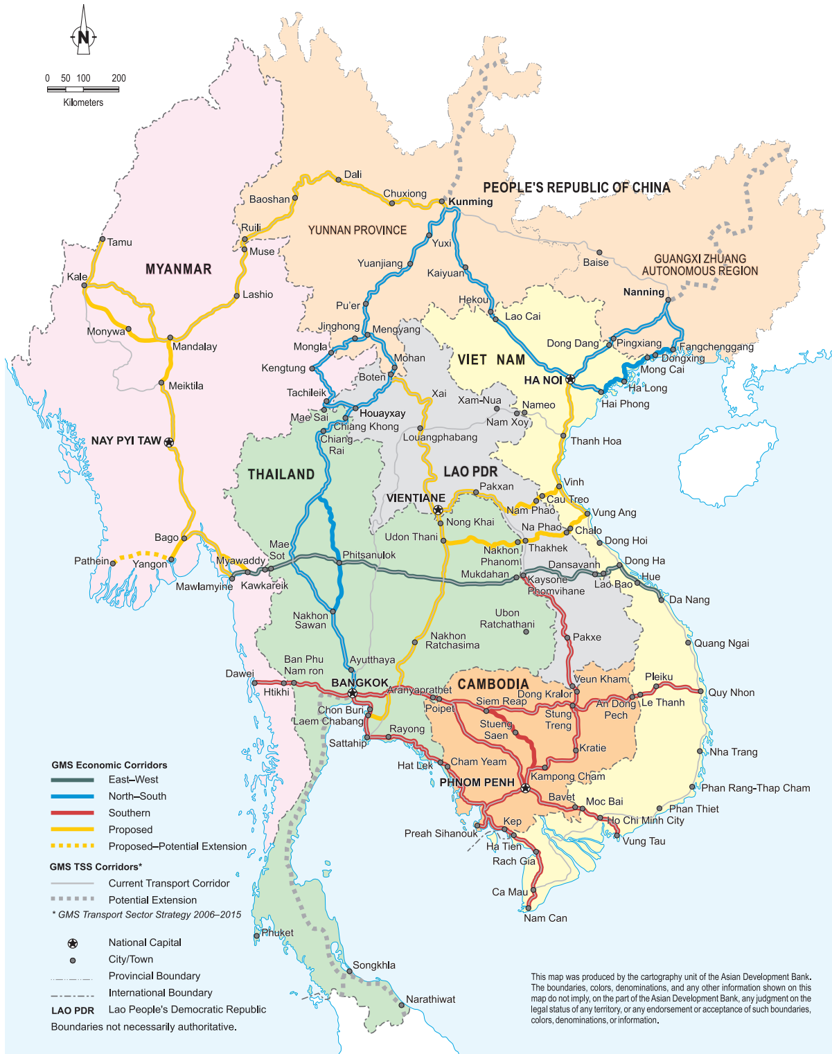
Figure 6: Proposed Realignment and/or Extension of the Greater Mekong Subregion Economic Corridors

GMS = Greater Mekong Subregion, TSS = Transport Sector Strategy.