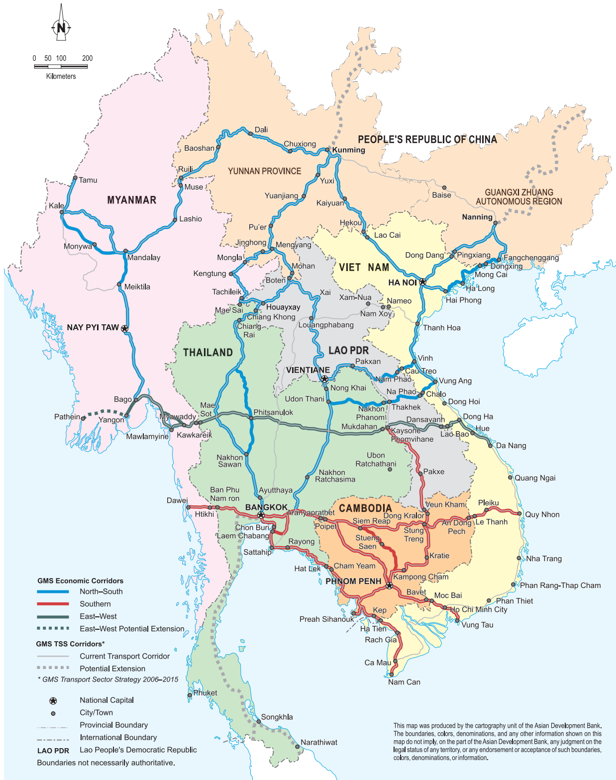
Figure 7: New Configuration of East–West Economic Corridor, North–South Economic Corridor, and Southern Economic Corridor

GMS = Greater Mekong Subregion TSS = Transport Sector Strategy.