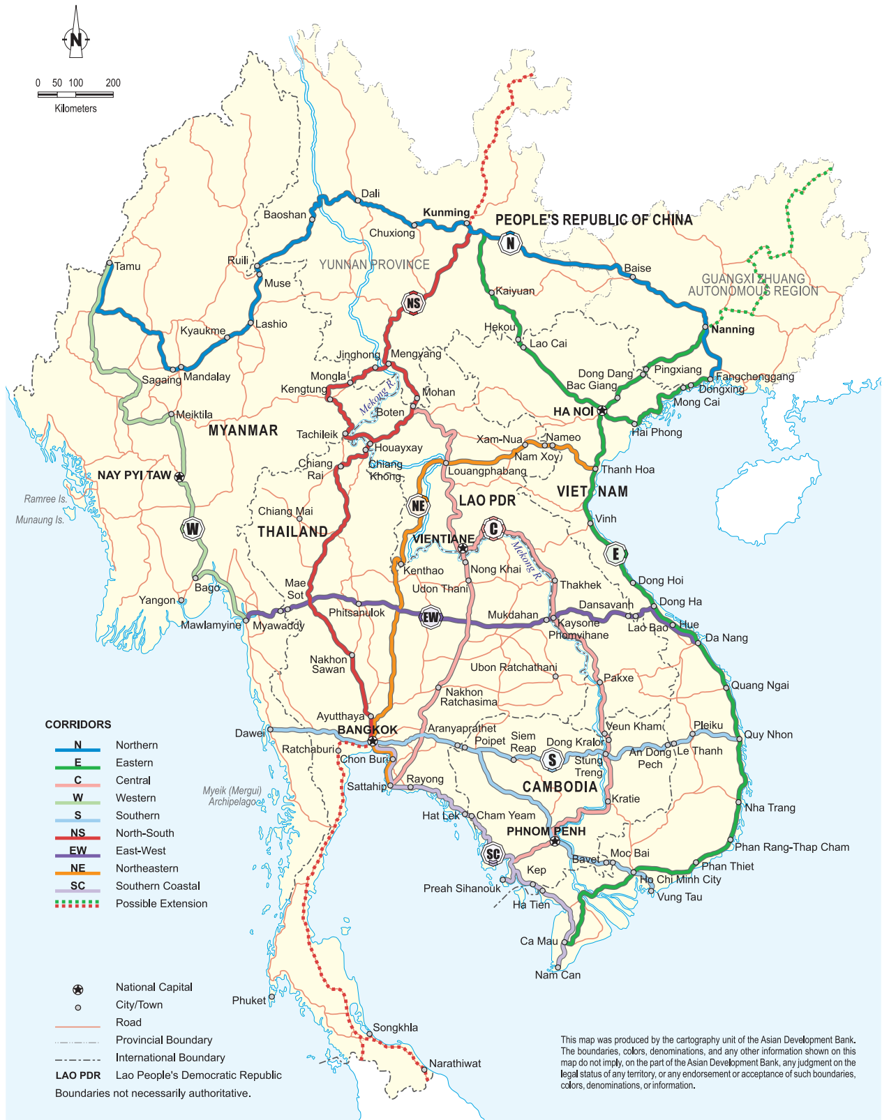
Figure 2: Greater Mekong Subregion Corridor Network in Transport Sector Strategy, 2006–2015