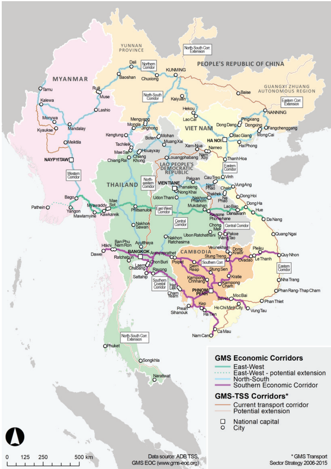
Figure 4: Overlay of the Greater Mekong Subregion Economic Corridors on the Greater Mekong Subregion Corridor Network