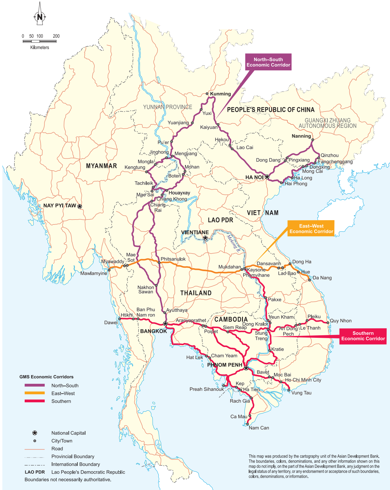
Figure 3: Present Configuration of East–West Economic Corridor, North–South Economic Corridor, and Southern Economic Corridor