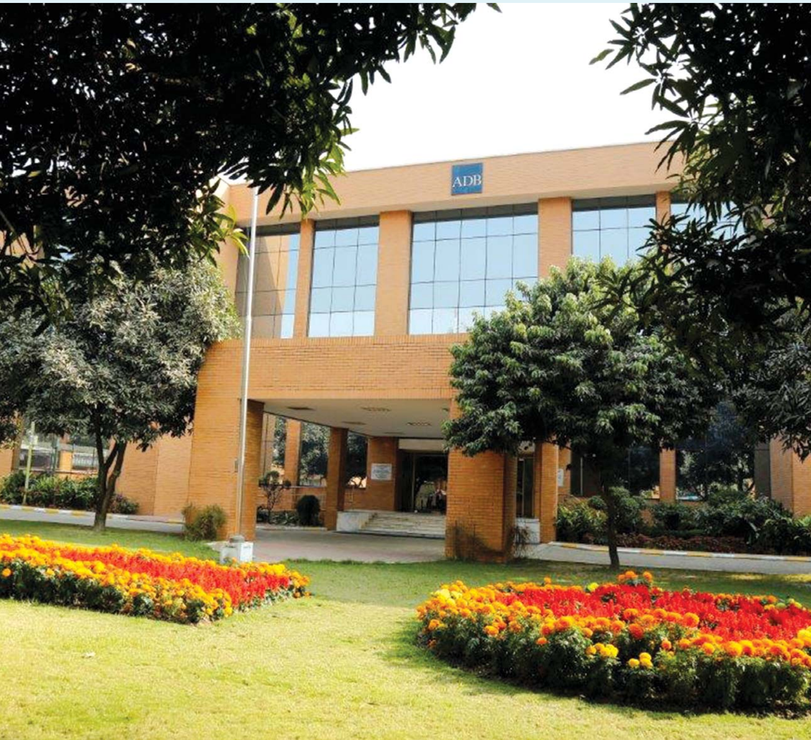
ADB's Bangladesh Resident Mission moved into its own building in 2004.