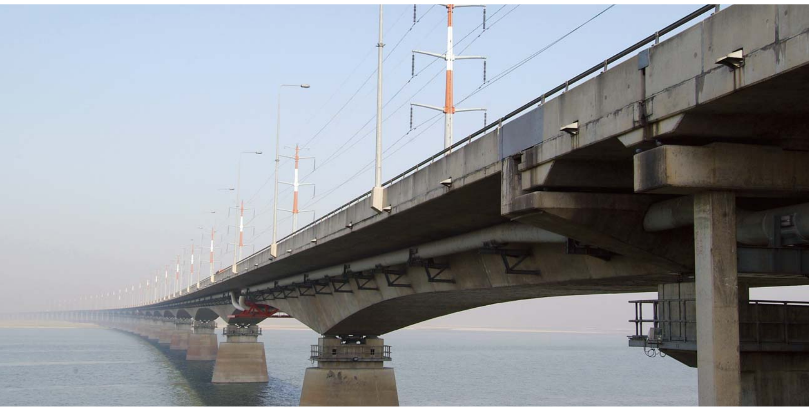
Bangabandhu Multipurpose Bridge

ADB financed complementary follow-on investment projects to expand the road network on the east side of the Jamuna River and connect the rail networks on either side. It provided $207 million for the bridge itself and an additional $182 million in two projects to improve access road and rail links.